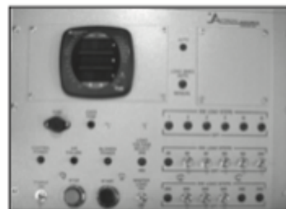
Operator Control Panel